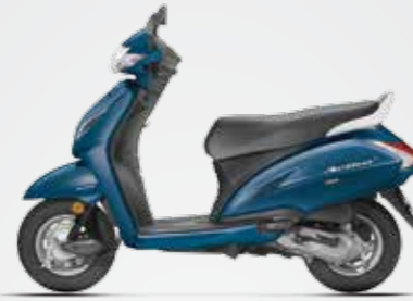
TRANCE BLUE METALLIC