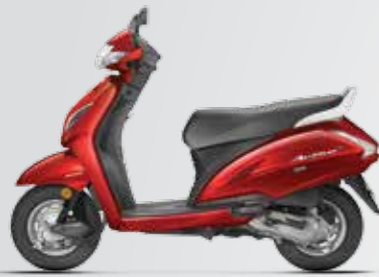
PEARL SPARTAN RED