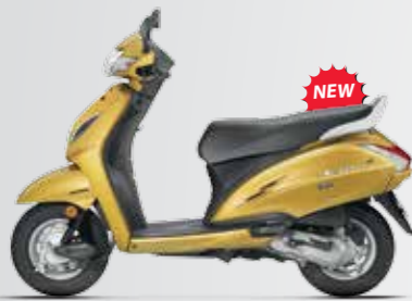
DAZZLE YELLOW METALLIC