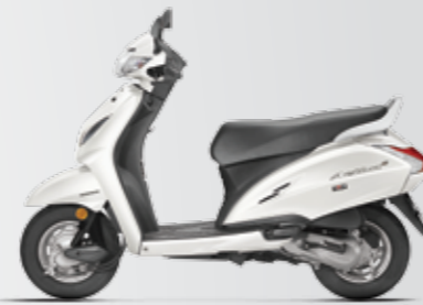
PEARL AMAZING WHITE