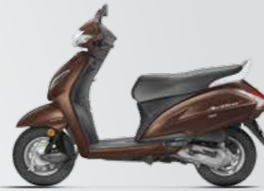
MAJESTIC BROWN METALLIC